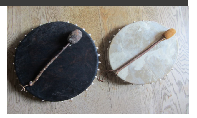
Hide and frame drums with beaters of twig and felt