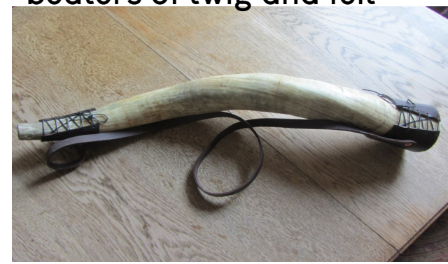
Giant War horn (Cow)